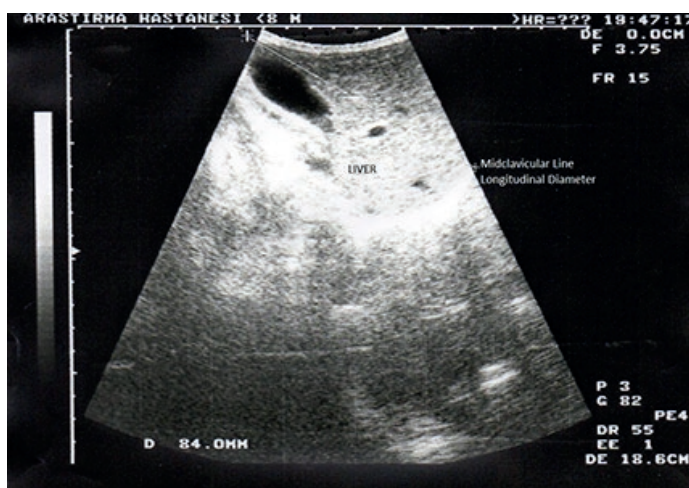
Fig. 1: Measurement of MCLLD from hepatic dome to lower hepatic margin

MCLLD for each subject was measured. The upper and lower points of the measurement of the liver span were marked and then measured from the sonographic image. (Fig. 1)